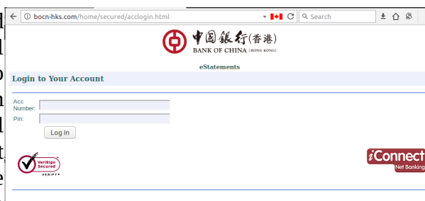
Fake Bank of China login

of the Hong Kong Police Force at 2860 5012.